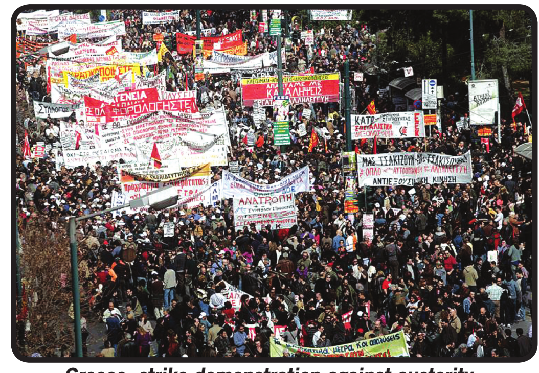
Greece: strike demonstration against austerity