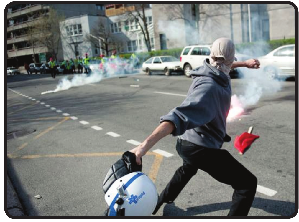
Montréal: May Day demonstration

ANTI-CAPITALIST DEMONSTRATION MAY 1<sup>st</sup>, 4:30 PM Champ-de-Mars, (intersection of St-Antoine and Gosford)